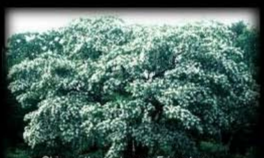
Chionanthus retusus - Fringetree