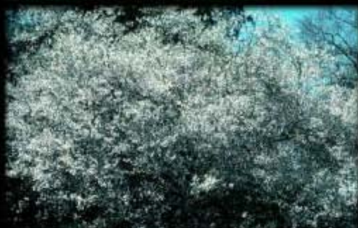
Prunus x 'Hally Jolivette'