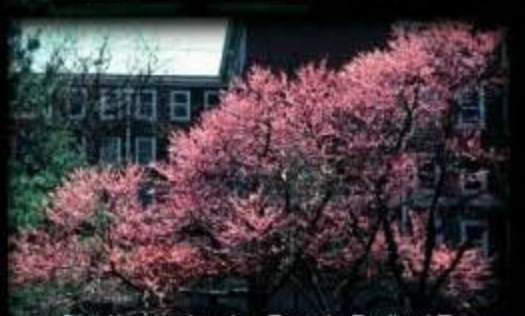
Cercis canadensis - Eastern Redbud Tree