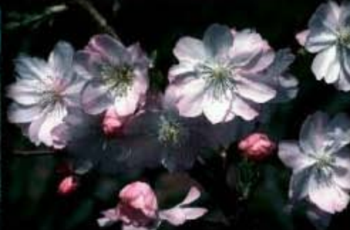
Prunus subhirtella 'Autumnalis' - Higan Cherry