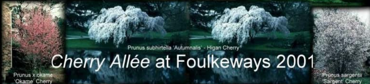
Prunus subhirtella 'Autumnalis' - Higan Cherry