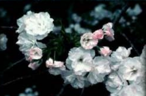
Prunus shirotae - 'Kwansan' Cherry