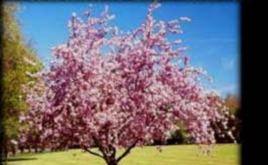
Prunus serrulata - 'Kwanzan' Cherry