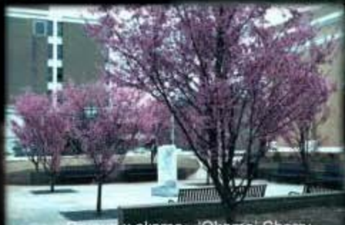
Prunus x okame - 'Okame' Cherry