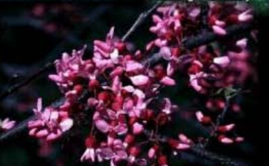
Cercis canadensis - Eastern Redbud Tree