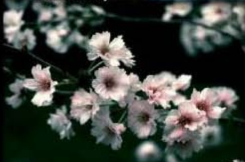
Prunus x 'Hally Jolivette'