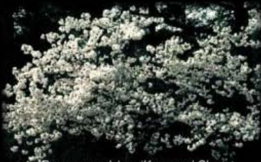
Prunus serrulata - 'Kwanzan' Cherry