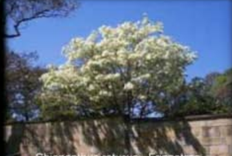
Chionanthus retusus - Fringetree