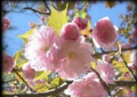
Prunus serrulata - 'Kwanzan' Cherry